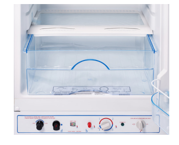
Front mounted controls with cover