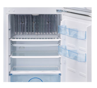
4 glass shelves 1 large crisper drawer