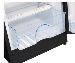
4 glass shelves 1 crisper drawer