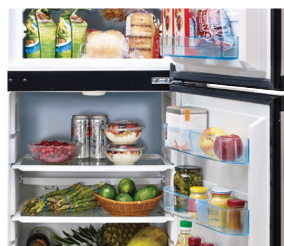
The world's leading DC compressor