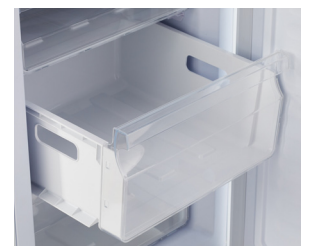
Multiple storage drawers for easy access