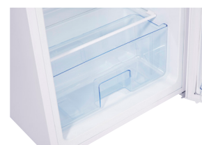
4 glass shelves 1 crisper drawer