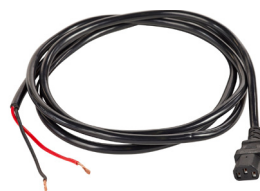
8ft electrical wire cut end included