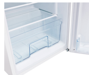
4 glass shelves 1 crisper drawer